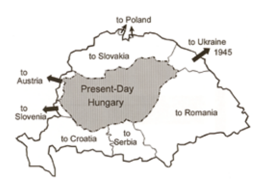
Figure 1: Territories in the neighbouring countries that were the part of the Hungarian Kingdom until 1920

of unbiased demographic data difficult, and results must be interpreted with caution.