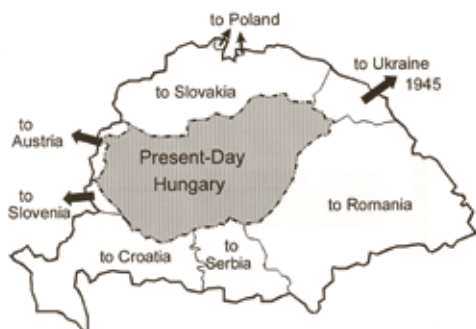
Figure 1: Territories in the neighbouring countries that were the part of the Hungarian Kingdom until 1920

Firstly, in the absence of Eurostat standards, questions and results on ethnicity were not collected and published in the same way in the different countries. Secondly, citizens have to declare their ethnicity under very different political or linguistic circumstances at censuses and these circumstances affect their ethnic self-identification. Experience has shown that in the case of individuals of less stable ethnic identity (e. g. people living in mixed marriages) ethnic self-identification is