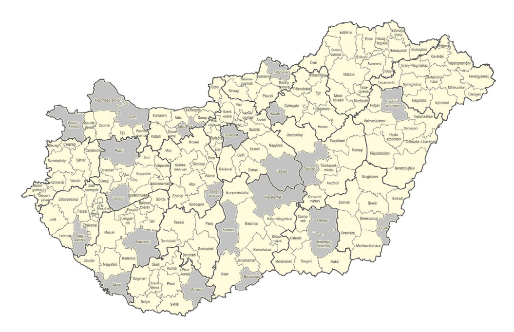
Figure 1. Map of micro-regions in the Hungarian historical social mobility file.

intermarriage among Christian denominations accounted for 10.5% of marriages within these denominations (in Hungary in that period, excluding Croatia) (the corresponding figure for Budapest was 26.5%). Those proportions rose to in excess of 12% and 30% respectively by the early 1910s (Vital Statistics, 1900–1912). In the 1920s the proportion of religious intermarriages stagnated at around 20% (Vital Statistics, 1919–1932). Thus, religious homogamy decreased considerably in the first part of the twentieth century; by 1930 the proportion of mixed marriages between Christians and Jews was as high as 13% (Vital Statistics, 1919–1932, pp. 26–27).